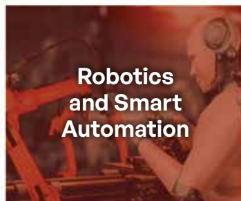
Robotics and Smart Automation