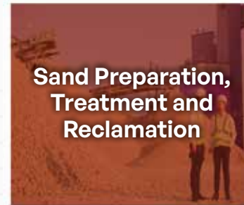
Sand Preparation, Treatment and Reclamation