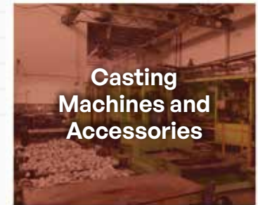
Casting Machines and Accessories