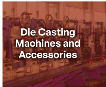
Die Casting Machines and Accessories