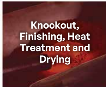
Knockout, Finishing, Heat Treatment and Drying