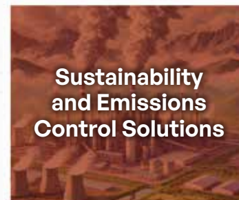
Sustainability and Emissions Control Solutions