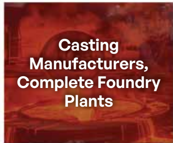
Casting Manufacturers, Complete Foundry Plants