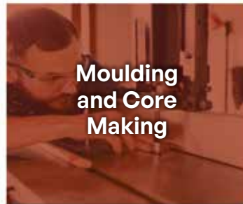
Moulding and Core Making