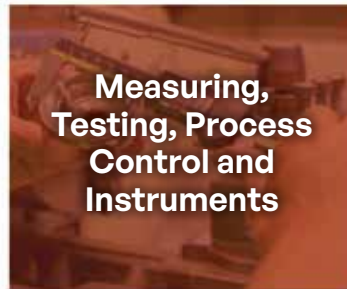
Measuring, Testing, Process Control and Instruments