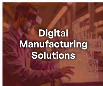
Digital Manufacturing Solutions