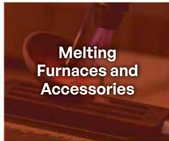
Melting Furnaces and Accessories