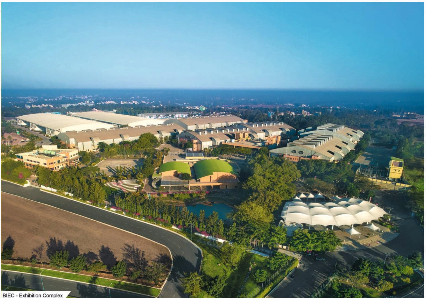
BIEC - Exhibition Complex

The self-contained campus is complete with state-of-the-art MICE facilities and support services for an incomparable business event experience. Apart from built-up facilities and reliable infrastructure, the Centre delivers expert technical services to make it the perfect venue in India for a grand event.