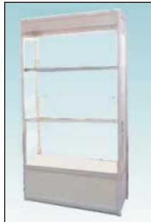
Glass Show Case