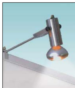
Arm Spot Light