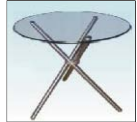
Round Table (Glass top)