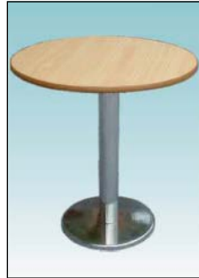
Round Table (Wooden top)