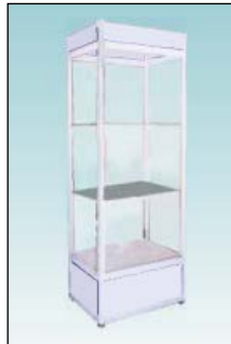
Show Case (Slim)