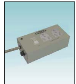
Socket Out Let