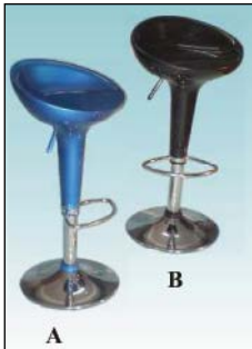
Bar Stool (Adjustable)