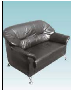
VIP Sofa Double